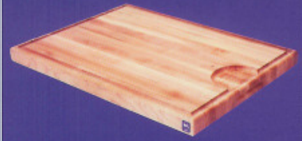
1 3/4" Gourmet Board