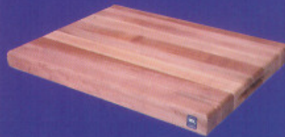
1 3/4" Cutting Board