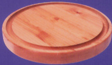
1 1/4" x 12" Dia.