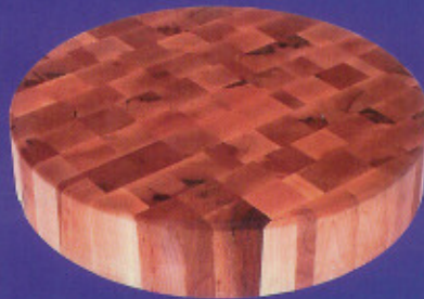
3 1/2" End Grain Dia.