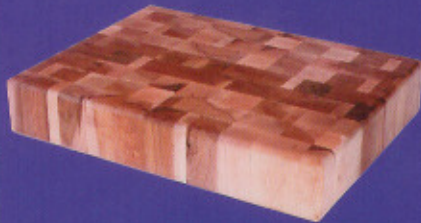
3 1/2" End Grain