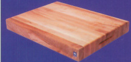
3" Cutting Boards